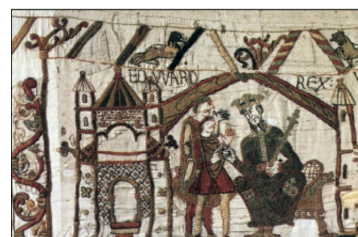
Harold is crowned King of England on 6th January 1066