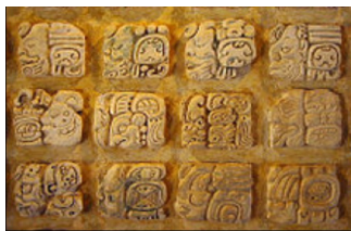
Glyphs carved on a monument