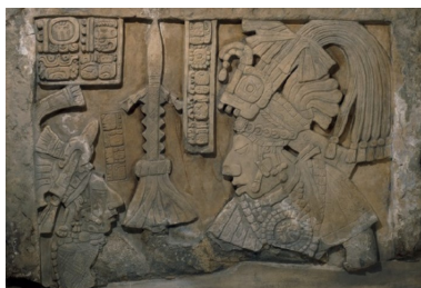
There were several rulers, this is Bird Jaguar VI on the right and his queen on the left.