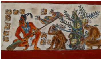
Creation story of Popol Vuh