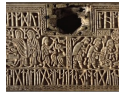
Runes and images, Franks Casket