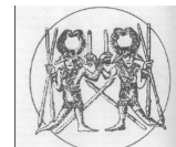
Spear-dancers with helmets with birds on, representing the god Woden, from the Sutton Hoo helmet. Eventually people adopted Christianity.