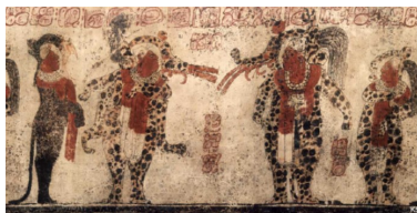
Two kings dressed as the Hero Twins who became the sun and moon