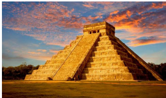
Pyramid at Chichen Itza