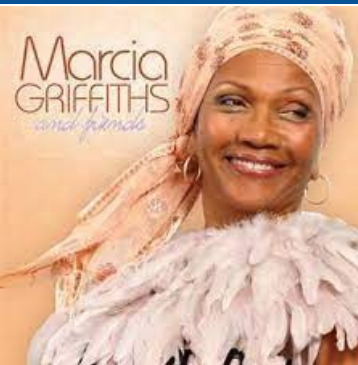
Marcia Griffiths—probably the best-known and most influential woman in the history of Reggae music.