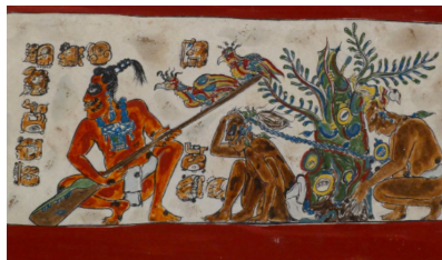
Creation story of Popol Vuh