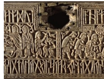
Runes and images, Franks Casket