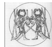
Spear-dancers with helmets with birds on, representing the god Woden, from the Sutton Hoo helmet. Eventually people adopted Christianity.