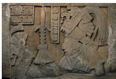
There were several rulers, this is Bird Jaguar VI on the right and his queen on the left.