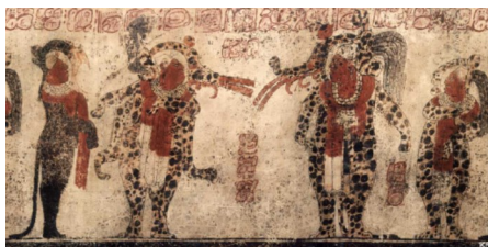
Two kings dressed as the Hero Twins who became the sun and moon